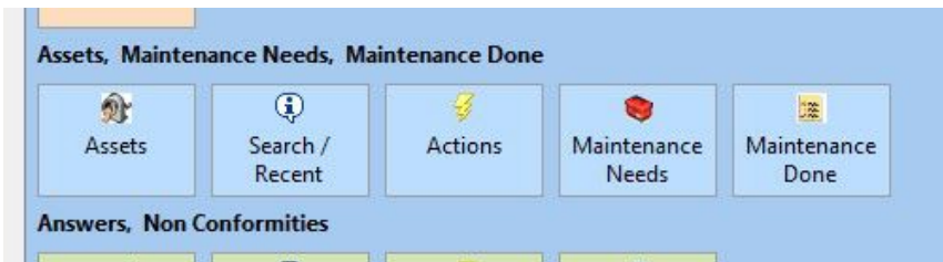
Assets, MaintenanceNeeds, MaintenanceDone Business Objects as they appear in the System Entities Screen